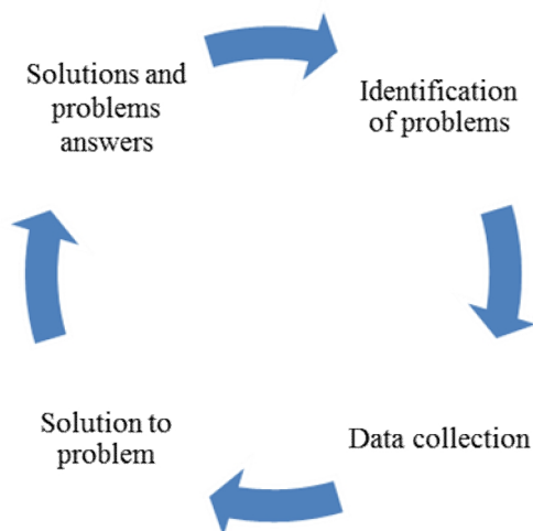
Figure 1. Data Analysis Process

The framework model used to analyze data and facts about the optimization of ZIS fundraising using Miles and Huberman interactive model (Moeleong, 1990: 18), it can be described as follows: