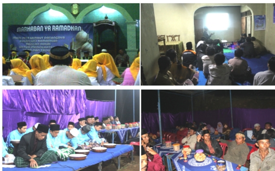
Picture 2. Several Activities of Mergolangu Citizens Communities

this can be found with the attitude of the citizens who are very harmonious, the number of citizens who interested with community gathering activities.